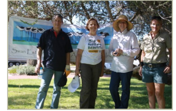
The Minister for the Environment with representatives from Keep Australia Beautiful, SERAG Inc. and DEC.