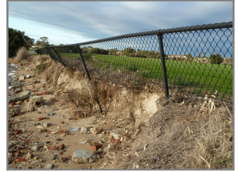
Erosion behind Troy Park

Much is being done to address the problem. For example, the Department of Environment and Conservation, the Swan River Trust and the Department of Transport are together taking strong action at the northern end of Milyu; and SERAG Inc. is endeavouring to stabilize the river margins of all three Reserves by steadily planting indigenous sedges, shrubs and trees.