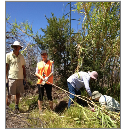
Volunteers remove one of many clumps of giant reed.

Nevertheless, a refreshing morning tea and lunch have provided welcome relief and reward for everyone's strenuous efforts.